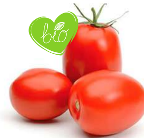
Tomate pera Plum tomato