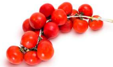
Tomate de Colgar Garland Tomato