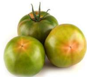
Tomate liso Salad tomato