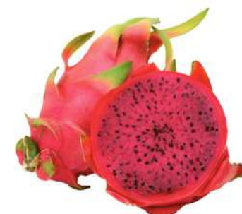
Pitahaya Roja Red pitahaya