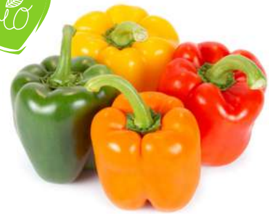
Pimiento California Bell pepper