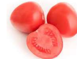
Tomate Pera Larga Vida Long Life Plum Tomato