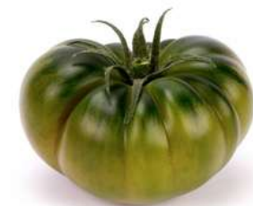
Tomate asurcado (Raf) Ribbed tomato