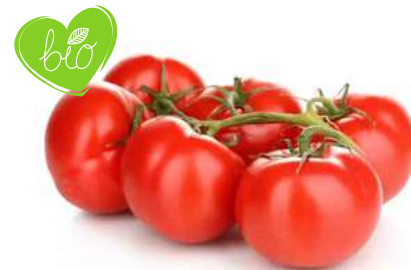
Tomate rama On the vine tomato