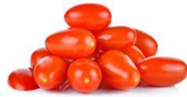
Tomate Cherry Pera Cherry Plum Tomato