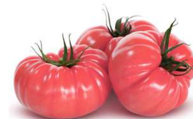
Tomate Asurcado Rosa Pink Ribbed Tomato