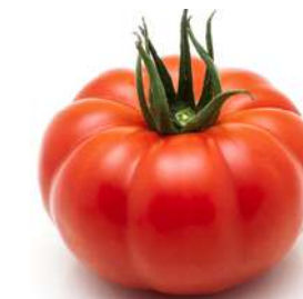
Tomate Asurcado Larga Vida Long Life Ribbed Tomato