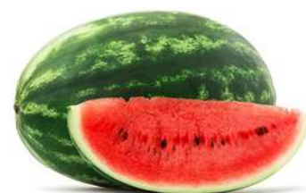
Sandía Larga Long watermelon