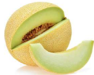
Melón Galia Galia melon