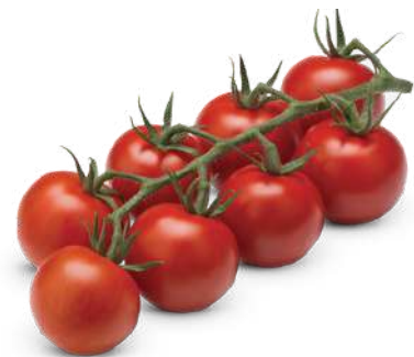
Tomate Cocktail Rama On the vine Cocktail Tomato