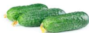
Pepino Español Spanish cucumber