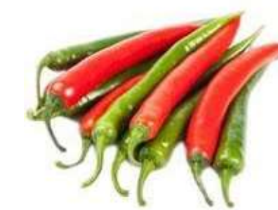
Pimiento Picante Chili pepper