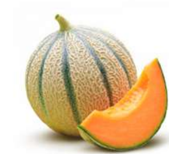
Melón Cantaloupe Cantaloupe melon