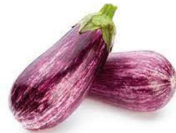
Berenjena rayada Striped aubergine