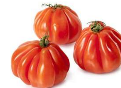
Tomate Corazón de Buey Beef Tomato