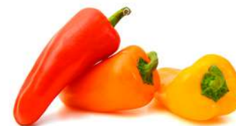
Pimiento Sweet Bite Sweet Bite pepper