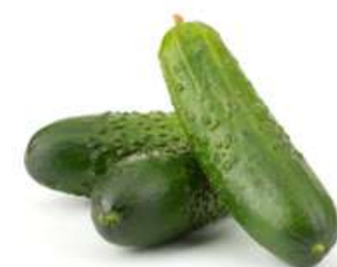
Pepino Francés French cucumber