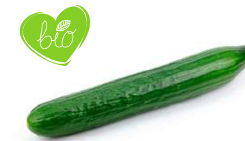
Pepino Almeria Long cucumber