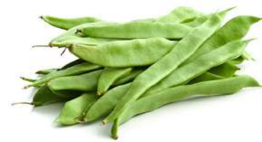
Judía Helda Helda bean