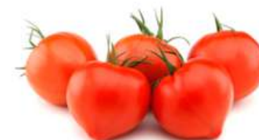
Tomate Huevo de Toro Heart Shape Tomato