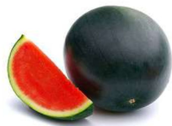
Sandía Negra sin pepitas Seedless black watermelon