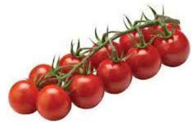
Tomate Cherry Rama On the Vine Cherry Tomato