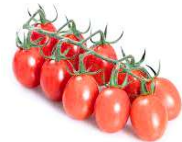
Tomate Cherry Pera Rama On the Vine Cherry Plum Tomato