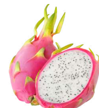
Pitahaya Blanca White pitahaya