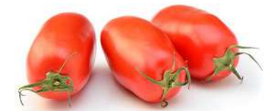
Tomate Pera San Marzano San Marzano Tomato