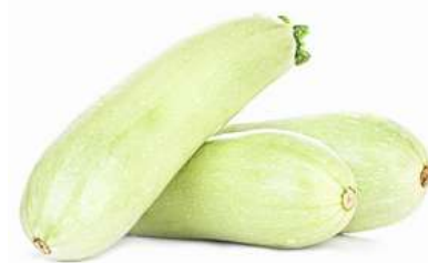
Calabacín blanco White courgette