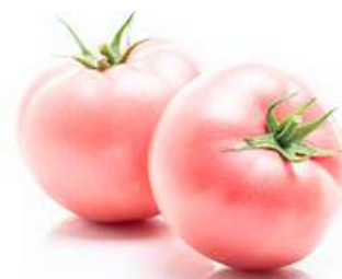
Tomate Rosa Pink Tomato