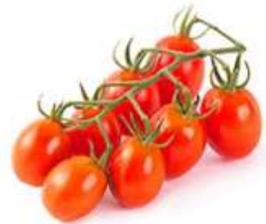
Tomate Cocktail Pera Rama On the Vine Cocktail Plum Tomato