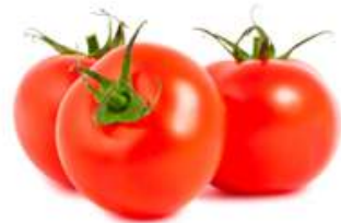
Tomate larga vida Long life tomato