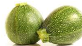
Calabacín redondo Round courgette