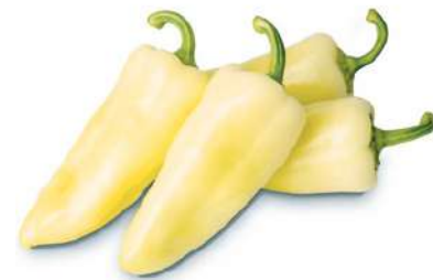
Pimiento Húngaro Hungarian pepper