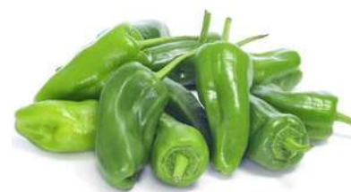
Pimiento Padrón Padron pepper