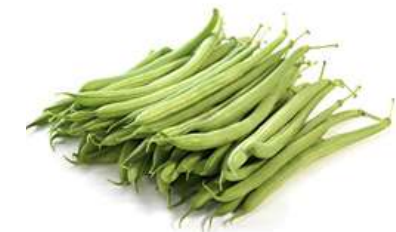
Judía Strike Strike bean