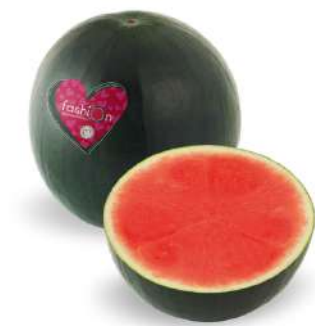
Sandía Fashion Fashion watermelon