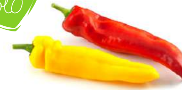
Pimiento Cónico Conical pepper