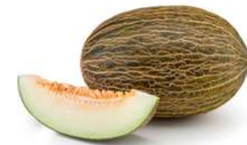
Melón Negro Black melon