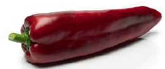
Pimiento Capia Capia pepper