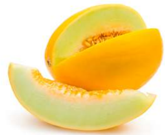
Melón Amarillo Yellow melon