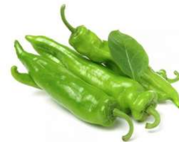
Pimiento Italiano Italian pepper