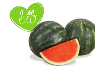
Sandía Mini Mini watermelon