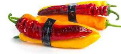
Pimiento Sweet Palermo Sweet Palermo pepper