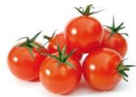
Tomate Cherry Cherry Tomato